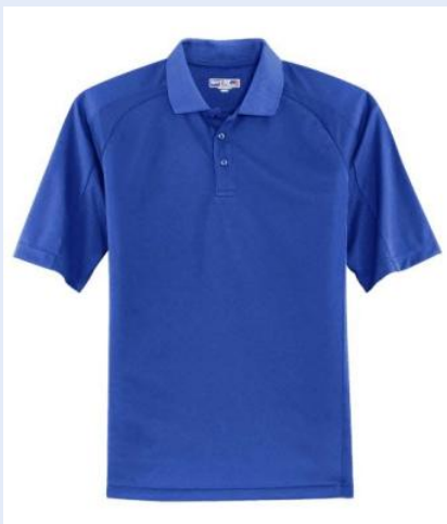
Royal Blue men's

This new vendor is: Sindy's Threads located at 17178 Knollside Avenue, Parker, Colorado 80134. www.sindysthreads.com 720-333-9093