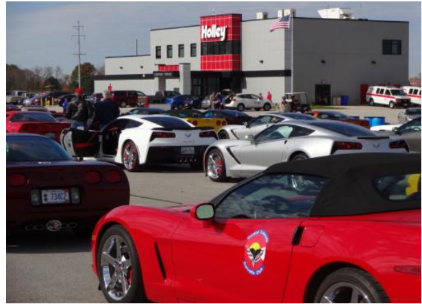
Barrett's 2008 Victory Red convertible at the NCM Motor Sports Park in Bowling Green. The car has a 7-speed with a red/black interior.....book ends!