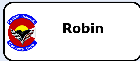
Name Tag (sample)