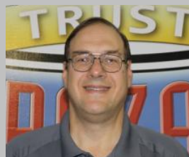
NCCC Governor Jim Cesario