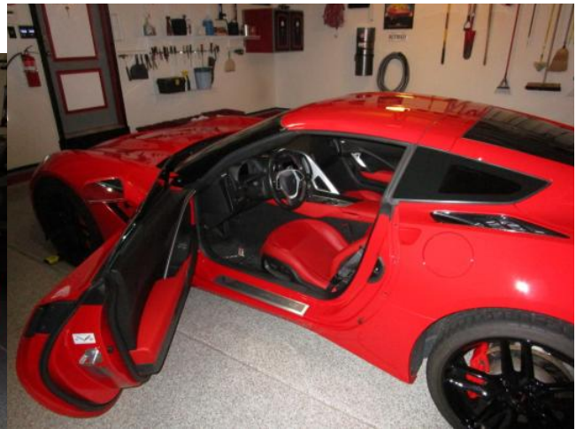
Sherron and Brodie Garnett's 2015 Torch Red/Red Coupe.