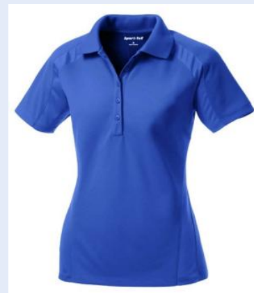
Royal Blue women's